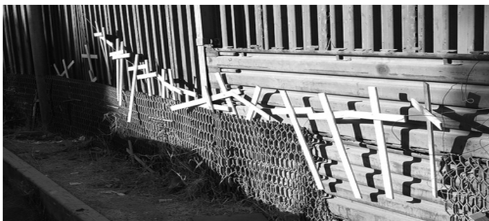
The photo was taken along the U.S.-Mexico border.

In November 1995, a 12-year old girl was play-camping with a friend in a vacant lot behind her home in Pirtleville. 10 As she slept curled up in a ball in their tent, she awoke suddenly to a sharp pain invading her knee. She had been shot. A bullet went through her knee and missed her head by five inches on its exit from her body. According to the Border Patrol agent's account, he shot at them because he thought that they were illegal immigrants or dogs. The young girl was rushed to the hospital where she had the first of many surgeries to restore her knee. The agent was suspended with pay and later transferred to another Border Patrol station. The girl's family sued the Border Patrol, but the case is still in court.